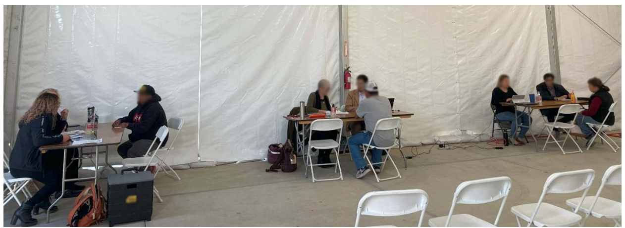
Residents of Pájaro, California, meet with MCL graduates and students for help with issues ranging from housing to FEMA paperwork required for needed relief funds. (De-identified photo)

As part of a coordinated emergency response, MCL students, graduates, staff, and faculty volunteered to provide legal assistance to families displaced and harmed by the 2023 flooding in Monterey County.