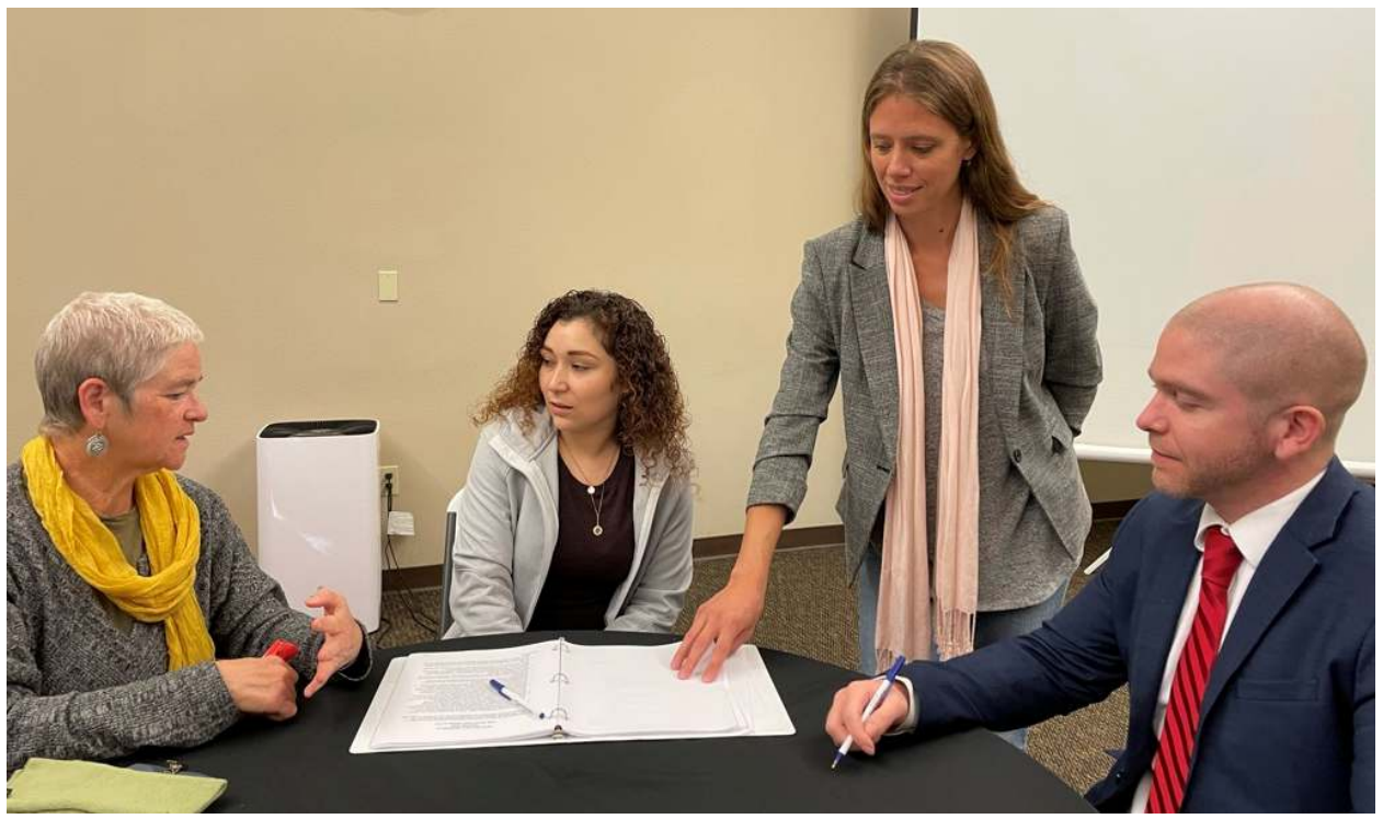
MCL faculty and students participating in a mediation training hosted by MGC.

Mediation is a form of alternative dispute resolution in which a neutral third person helps the parties reach a voluntary resolution of a dispute. Mediation is an informal, confidential, and flexible process in which the mediator helps the parties to understand the interests of everyone involved and explore and work towards options for resolution that may be preferable to litigation.